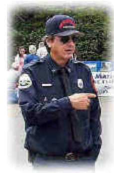
From fire protection to water protection Dunes City depends on generous people

When septic tank systems are improperly located, designed, installed, or maintained, liquid wastes can flow to the ground's surface and can also pollute groundwater. Surface flow creates offensive odors and can be a health hazard, often contaminating organisms that cause typhoid fever, dysentery and other diseases. Surface sewage flow into ponds provides a