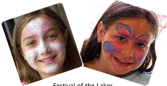
Festival of the Lakes Face painting ~ a hit with the kids - Imagination has no bounds -